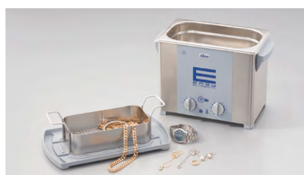
Elmasonic EASY for cleaning jewellery and watch parts

Explore more https://www.harshad.com/elma