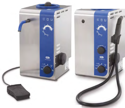
Elmasteam 8 Basic

The compact Elmasteam 8 basic with 8 bar steam pressure is the ideal steam cleaning machine for smooth and environmentally friendly pre- and final cleaning tasks.