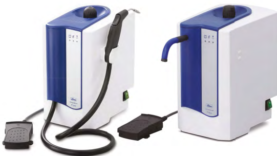
Elmasteam 4.5 basic HP Elmasteam 4.5 basic

The Elmasteam 8 med steam jet cleaner is the ideal tool to pre-clean burrs, drills and electro-surgical instruments, instruments and smoothly removes even tenacious contaminations