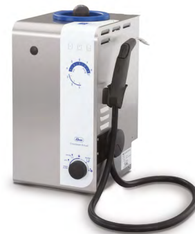
Elmasteam 8 Med

The compact Elmasteam 8 basic with 8 bar steam pressure is the ideal steam cleaning machine for smooth and environmentally friendly pre- and final cleaning tasks.